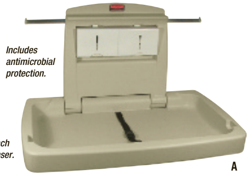
Includes antimicrobial protection.