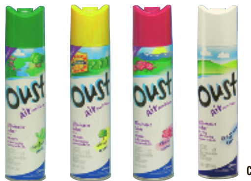
Oust® Air Sanitizer kills airborne bacteria and eliminates odor.