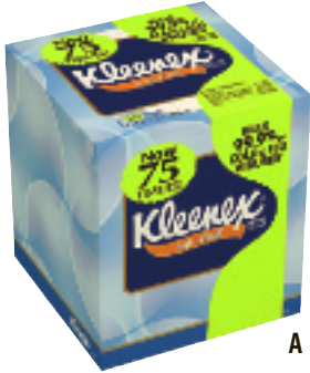
Proven protection against cold and flu viruses.