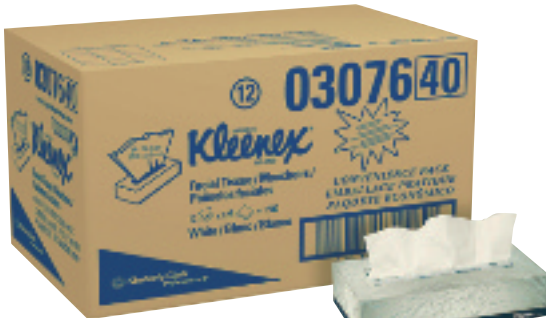
Available in convenient case of 12 boxes.