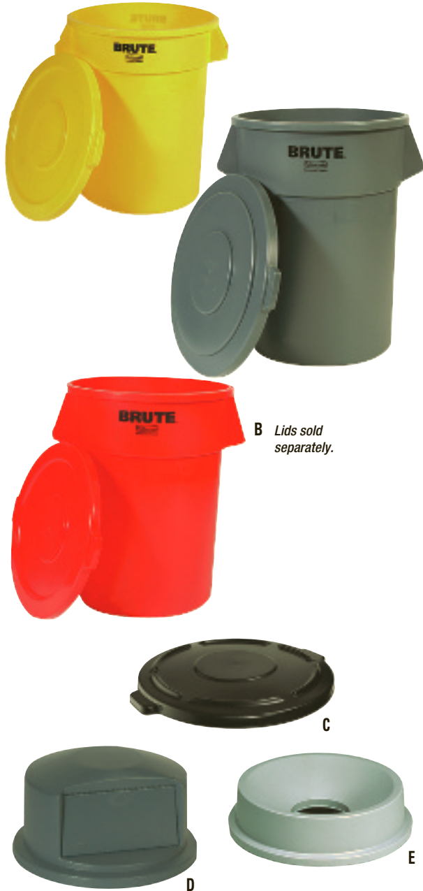
B Lids sold separately.