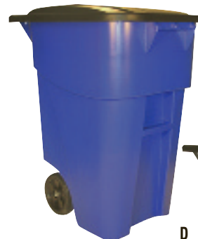
Shown with lid (sold separately).