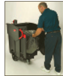
Carries larger loads, makes waste sortation easier and reduces worker strain.