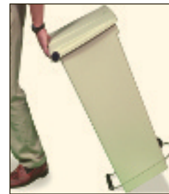
Rear roller on E. provides stability and easy transport.