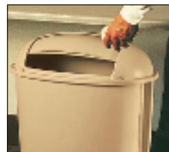
Roll top lid opens easily without the need for overhead clearance.