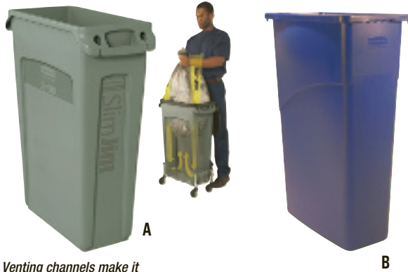
Venting channels make it easier to lift full can liners from the container.