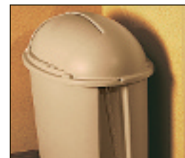
Slim, oval shape fits under counters and out of the way.