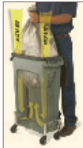
A Venting channels make it easier to lift full can liners from the container.