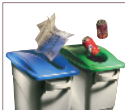
Tops also fit RCP 3541 and RCP 3554 (sold separately).